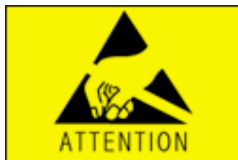
Figure 1: ESD Logo